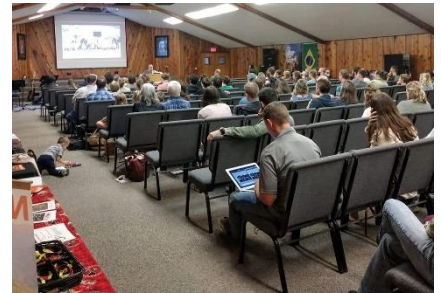
In class at Ethnos360 Training

I graduated April 9, 2022, with 48 other new missionaries who will all be transitioning into a variety of roles in places like Mexico, Brazil, West Africa, South Asia, Papua New Guinea, and the Philippines. All working towards the same goal: to see those without knowledge of or access to the Gospel and God's Word be reached and equipped to mature and multiply for generations to come.