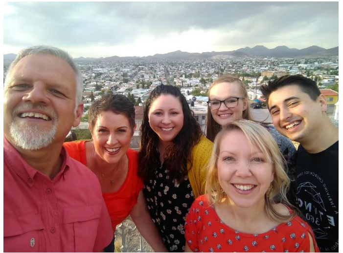
Chihuahua, Mexico 2021

The Bible College and Training Center have made it possible for many Mexican people to receive the training required to join Ethnos360 and become church planters. I was so blessed to go down there and find Mexicans, Americans, Colombians and Europeans all partnering as co-workers to reach the unreached.