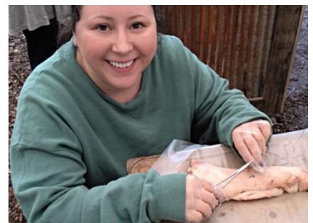
Learning to suture in a Field Health class