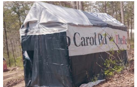
My house in the woods